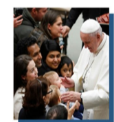
10 th World Meeting of Families